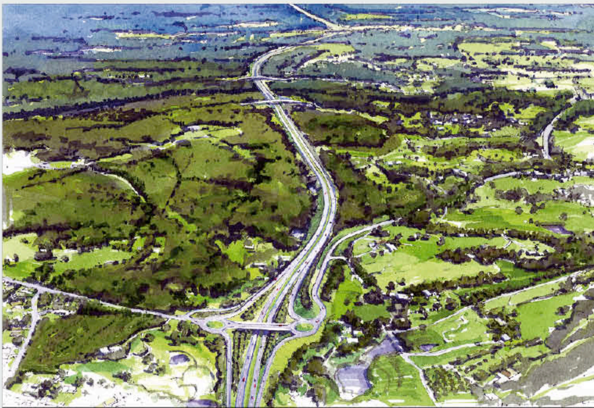
Main alignment looking south from northern end of the project with existing Lyons Road interchange in foreground