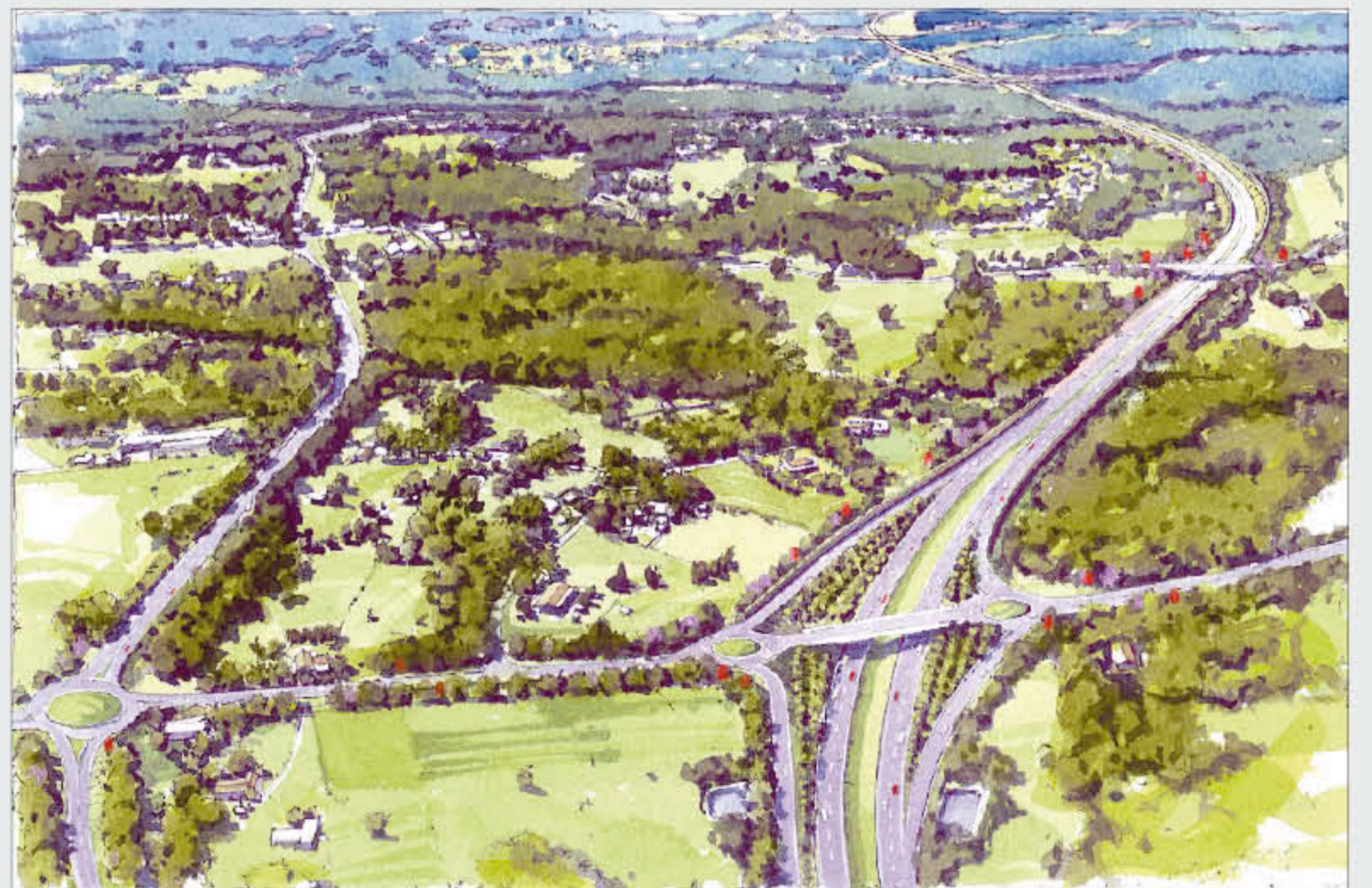
Main alignment looking north with Archville Station Road in the foreground.